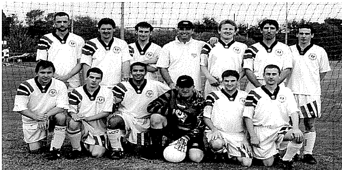
What a handsome bunch of blokes!